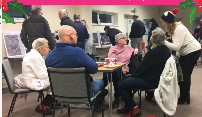
Matson residents at the Christmas party