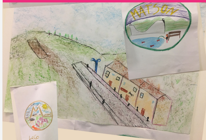
Some of the postcards designed by the students