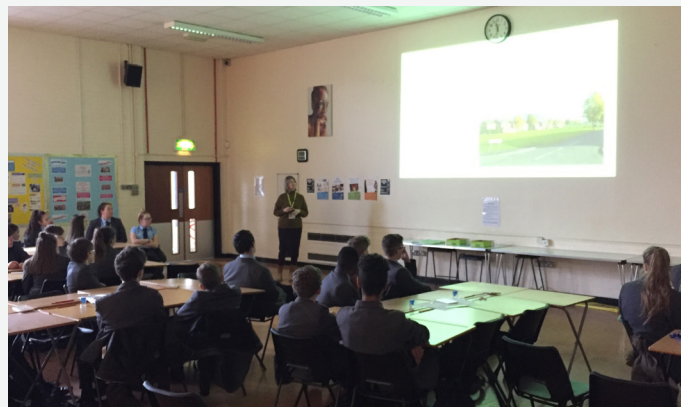
Students at Beaufort Co-operative Academy

In November and December Kevin Murray Associates, with help from GCH ran 'Shaping the future' school sessions with students from Gloucester Academy and Beaufort Co-operative Academy. The students were asked to think about Matson today and reflect on what they considered to be the weaknesses in their neighbourhood. Having identified areas of improvement they were asked to agree 3 issues that were a priority to be addressed. With these 3 priority areas in mind, the students designed and wrote postcards from the future representing Matson in 2030, once the improvements had taken place. Working with the next generation of residents helps to get them thinking about and involved in a real-life 'place-making', improving a neighbourhood they want to continue living in or move to when they're older. The children were really enthusiastic, coming up with lots of useful ideas for what they'd like to see happen and what it might look like.