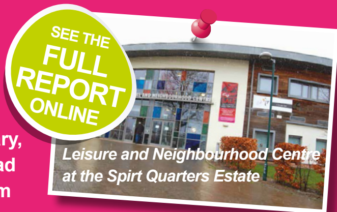
Leisure and Neighbourhood Centre at the Spirt Quarters Estate