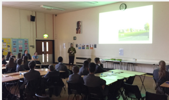
Students at Beaufort Co-operative Academy

On December 15th Kevin Murray Associates, with help from GCH ran a 'Shaping the future' school session for two Geography classes at Beaufort Co-operative Academy. The students were asked to think about Podsmead today and reflect on what they considered to be the weaknesses in their neighbourhood. Having identified any weaknesses they were asked to agree 3 issues that were a priority to be addressed. With these 3 priority areas in mind, the students designed and wrote postcards from the future representing Podsmead in 2030, once the improvements had taken place. Working with the next generation of residents helps to get them thinking about and involved in a real-life 'place-making', improving a neighbourhood they want to continue living in or move to when they're older. The children were really enthusiastic, coming up with lots of useful ideas for what they'd like to see happen and what it might look like.